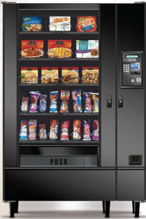
MODEL 460 - FROZEN CABINET MODEL 459 - CONTROL MODULE